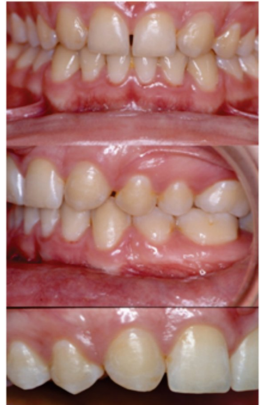
Fig 5a-c: Intraoral photographs in occlusion. There are Class-I occlusion of the 6 with physiological overjet and overbite.

closure: Positioning of the canine teeth in place of the lateral incisors. This approach requires a balancing extraction of two premolars in the mandible. The parents of the patient were alerted of the advantages and disadvantages of both alternatives discussed. They ultimately chose for the extraction therapy in the mandible and close the gap in the upper jaw.