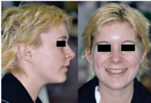
Fig 9a-b: The extraoral images show a beautiful smile with a natural harmonious profile.