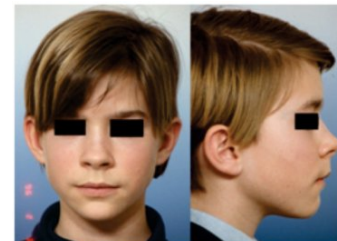
Fig 1a, b: Extra-oral images show a harmonious profile in the vertical, sagittal and transversal.

The profile is harmonic in both the sagittal as well as in the vertical dimension ( FIG 1a, b ). The intra-oral images show the beginning of the treatment, an Angle Class I occlusion of the first molars on both sides ( FIG 2a-d ). In a frontal image, the canines are at the position of the lateral incisors. The gaps for the missing lateral incisors are closed. In the upper arch there are rotations of the premolars both right and left. In the Lower arch crowding exists, about a 7mm.