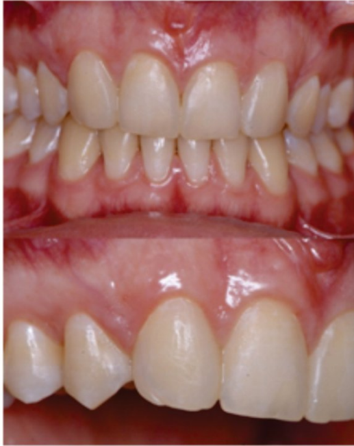
Fig 8a-c: The intra-oral images show the situation after the end of treatment