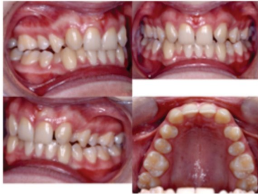
Fig 2a-d: Agenesis of teeth 12 and 22 with significant crowding in the mandibular arch. Gap opening for the missing teeth is hardly possible with simultaneous resolution of crowding in the lower jaw. The almost closed gaps for the lateral incisors orthodontic be closed, so that the teeth 13 and 23 are positioned at the location of the missing teeth. In the lower jaw the teeth 34 and 44 extracted in return.